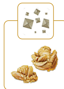
Calcium oxalate crystals and stones