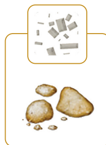
Struvite crystals and stones

There are different types of urinary stones, the composition of which depends on the minerals that form them. Some may be dissolved by a special diet: this is notably the case for struvite stones (these are the S in S/O). Others such as calcium oxalate stones (the O in S/O) can only be removed by surgery or other means. Stones may also be made up of layers of different types of minerals.